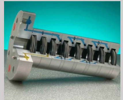
Packing case with cooling

Saves water – up to 15 l/min (4 Gal/min)