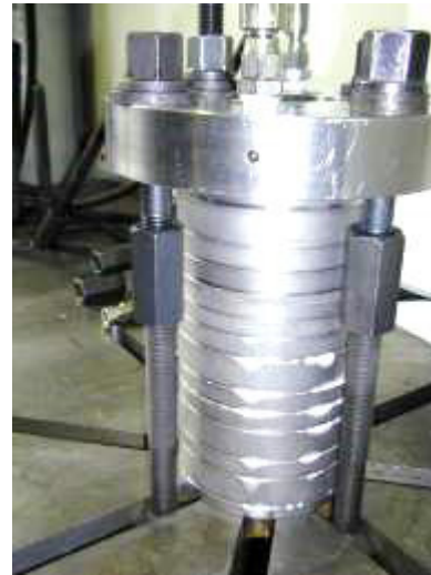
Gas leaking out of the cooled cups