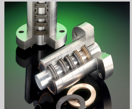
Packing case without cooling