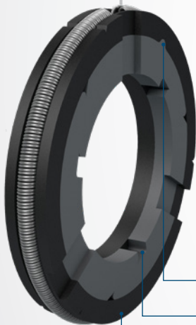
Single acting EMISSIONGUARD TR 2 packing ring

CPI's EMISSIONGUARD™ TR 2 packing ring is the only ring design that multiplies the benefits of a tangent to rod ring and a step tangent ring by combining the two rings into one, providing a more efficient seal, reduced friction and extended lifetime.