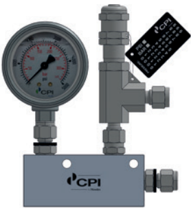
Balancing Valve Assembly

When ordered as an assembly (BVA), the balancing valve is manifolded together with a tube stem mounted on a male connector tube fitting. Operators can easily adjust the orientation of the pressure gauge in the field.